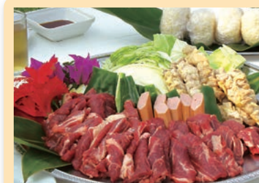
Photo shows 2-3 servings.

*Child: Ages 6-12 / Adult: Ages 13+ *Tours and schedules may change due to season or weather.